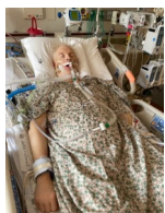
May 24-June: Intubated & sedated