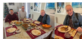
January 1, 2022: New Year Lunch with house-guests from Malaysia, We will host them until February 17, 2022.

In 2021, neither COVID-19 nor life-threatening health issues have deterred nor hampered our daily love for our LORD Jesus Christ. They kept us very busy and expanded our witness-outreach ministry to the medical communities and to our immediate neighbors.