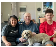
September 26: Glad to be home together