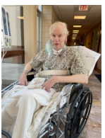
July 13: 1st wheel-chair ride in hospital