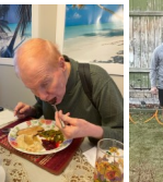
December 5: Yard work