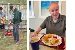
December 5: Pre-surgery “All-You-Can-Eat” hamburger meal