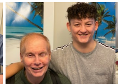
November 25: Happy THANKSGIVING