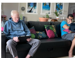
September 26: iFCF Sunday Worship Service with house-guest from Iran-Kuwait