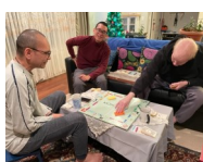
December 31: Monopoly game with house-guests from Malaysia